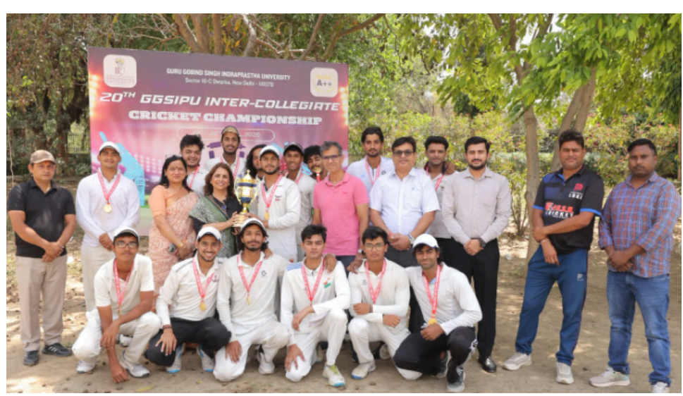
ADGIPS Crowned Champions at GGSIPU Cricket Championship 2026!