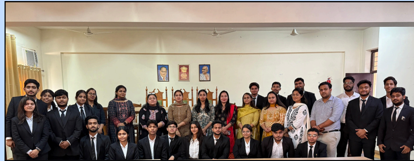
Intra-Moot Court Competition