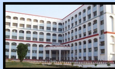
Babu Banarasi Das Northern India Institute of Technology, Lucknow (Formerly Northern India Engineering College) (BBDNIIT) Lucknow