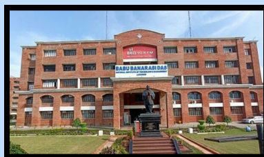
Babu Banarasi Das Institute of Technology and Management (BBDITM) (Lucknow).