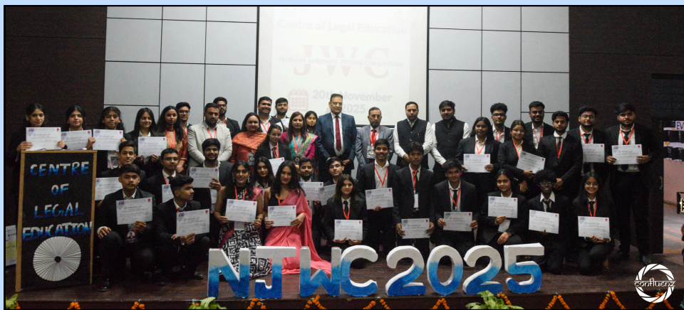
National Judgment Writing Competition