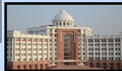
Babu Banarasi Das University (BBDU) Lucknow: Offers various UG/PG courses including Engineering, Management, Architecture & law