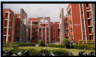
Dr. Akhilesh Das Gupta Institute of Professional Studies (ADGIPS), New Delhi.

ADGIPS is part of the BBD Group of Education, one of North India's leading educational groups. With over 1,500 faculty members and a student community exceeding 25,000 across campuses, the group is known for its commitment to quality education, research excellence, and strong industry collaboration.