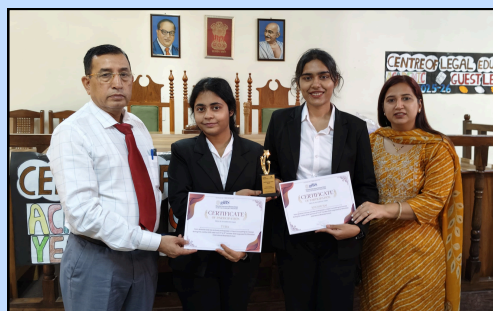
Our students bagged the 'Best Counsel' Award, Client Counselling-Justitia 2025, organized by Gitarattan International Business School