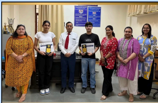
Our students achieved a remarkable victory by receiving the Award for the 'Best Moot Court Team' & for 'Best Legal Drafting', in the Experiential Legal Workshop cum Competition: From Crime Scene to Court Room, organized by CPJ College of Higher Studies & School of Law