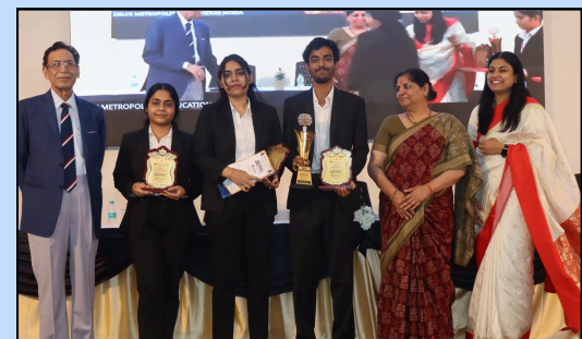
Our students won the 'Best Memorial Award' in the Moot Court Competition- Jus Cosmos 2025, organized by Delhi Metropolitan Education Law School