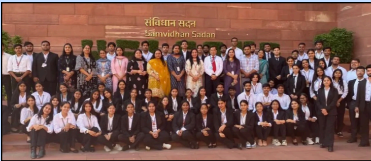
Visit to the Parliament House