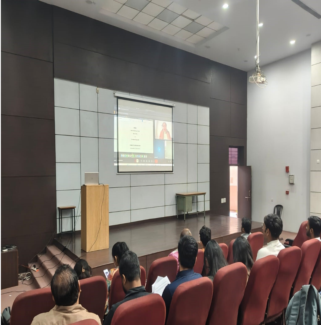
Photograph of the Auditorium setup showing the projector display of the Google Meet session along with the presence of faculty members.