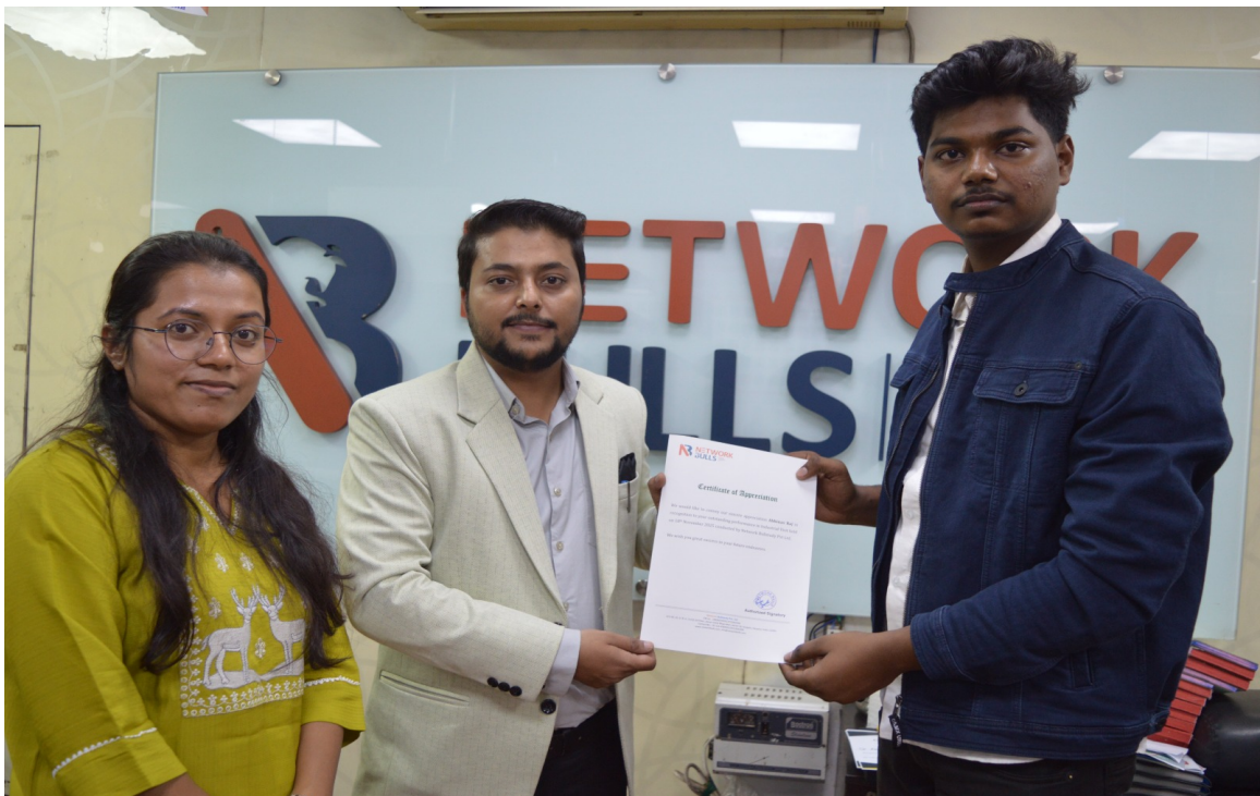
Photograph capturing the distribution of certificates of appreciation to winners of quiz competition held at Network Bulls.