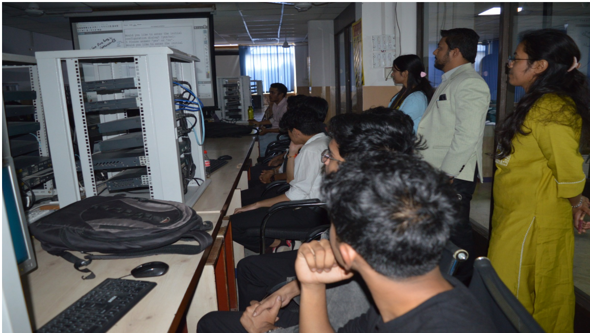
Students exploring the networking lab setups under professional guidance.