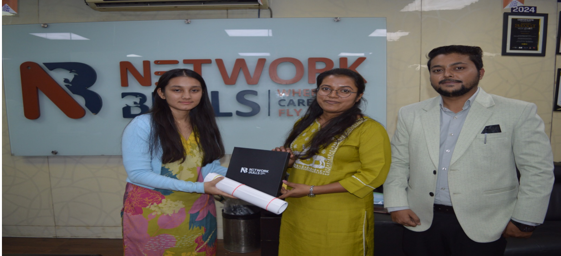
Photograph capturing the rewarding certificate of coordination and goodies to faculty coordinators.