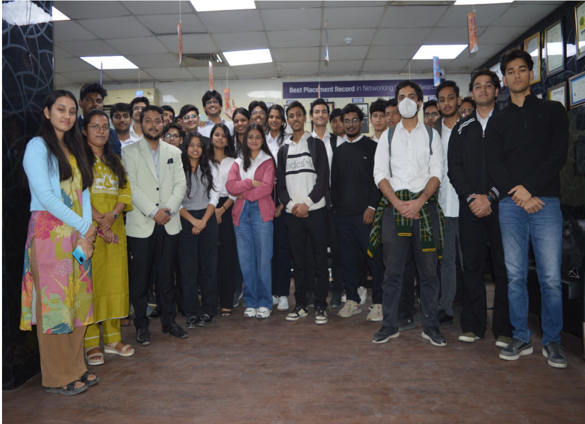
Group photograph of students and faculty coordinators at Network Bulls Pvt. Ltd., Gurgaon.