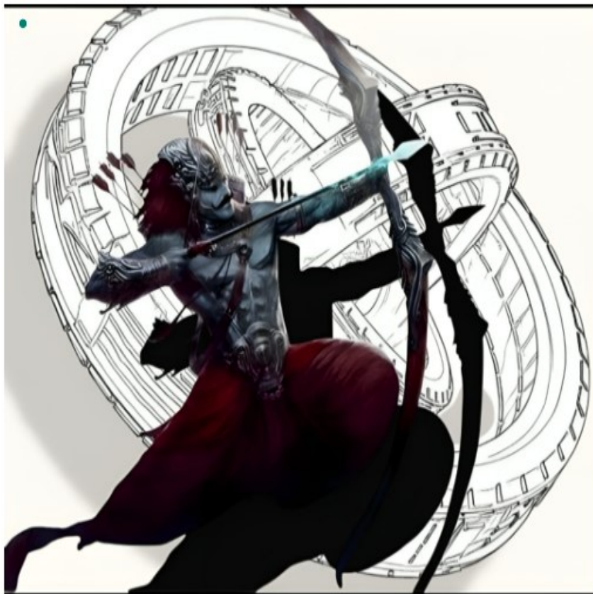
Logo Designed by: AKHIL ADITYA