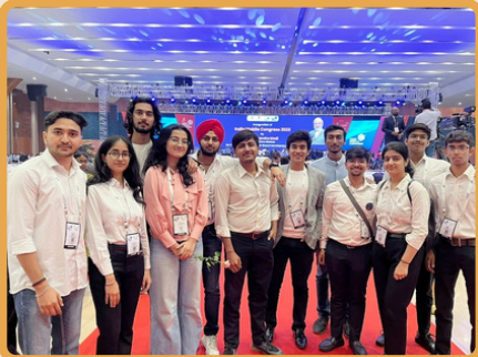
Bharat Mandapam, pragati Maidan