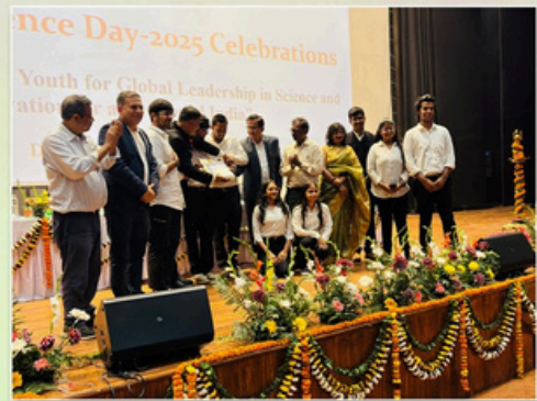
2 Second prize : Hydraulics Team ADGIPS