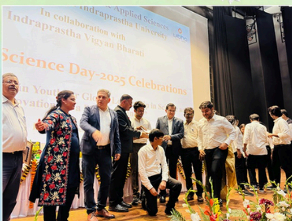
3 Third prize : Solar Distillation Team ADGIPS