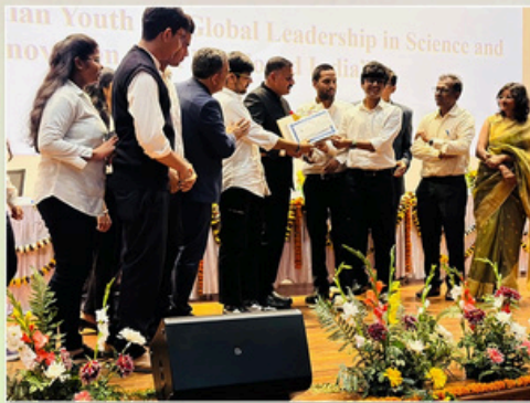
1 First prize : Carbon Purification Team ADGIPS

ADGIPS created a history in GGSIPU on Science Day dated on 28 february 2025