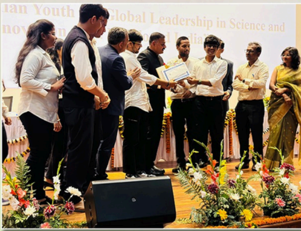
1 First prize : Carbon Purification Team ADGIPS