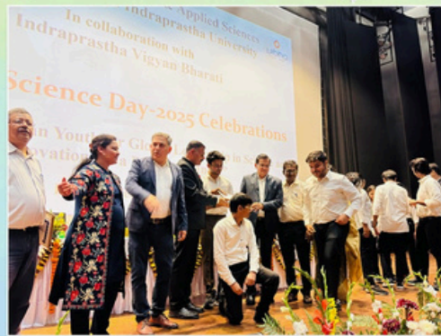
3 Third prize : Solar Distillation Team ADGIPS