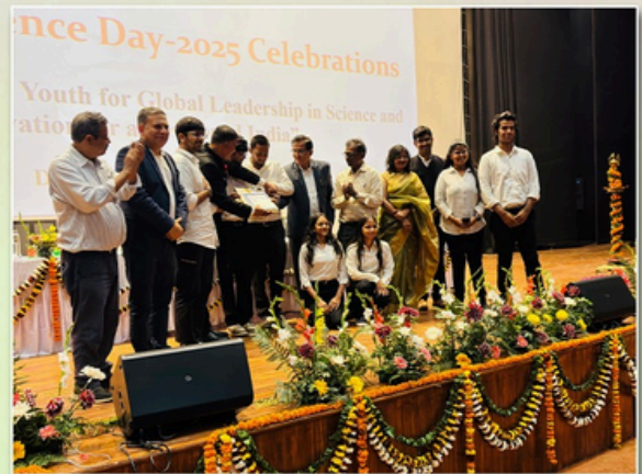
2 Second prize : Hydraulics Team ADGIPS