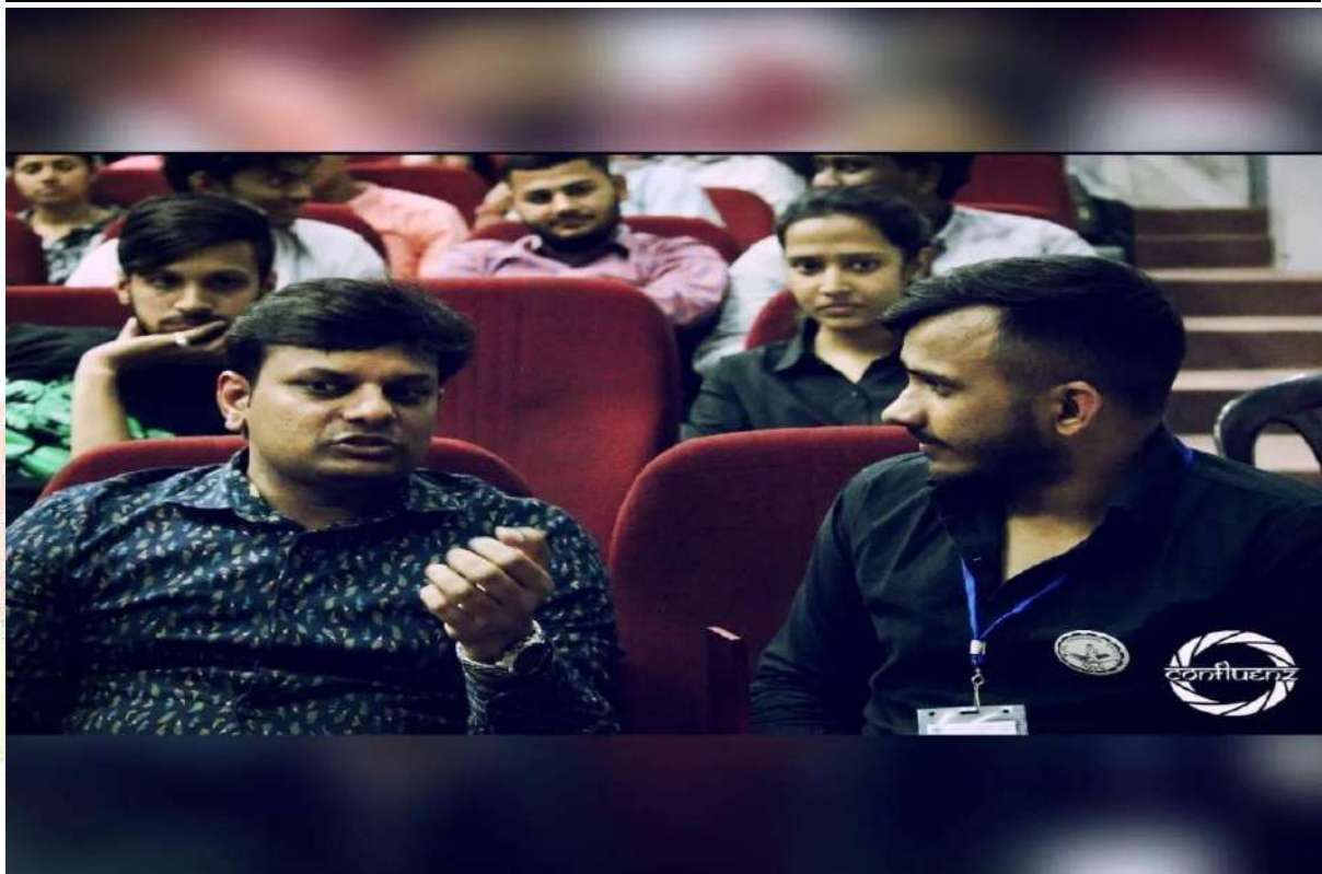
Glimpse of Expert Talk & Interaction of Students with Expert