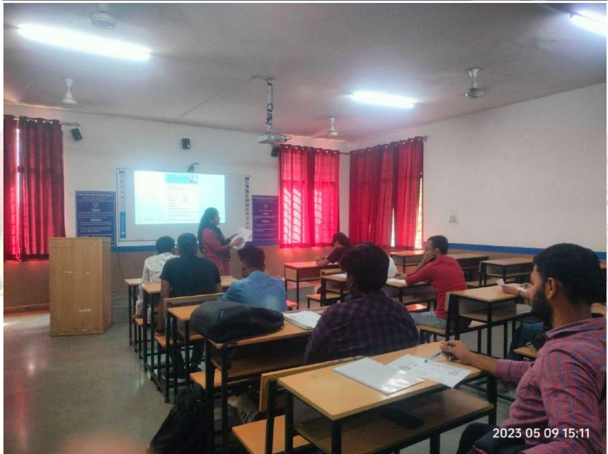
Glimpse of Event