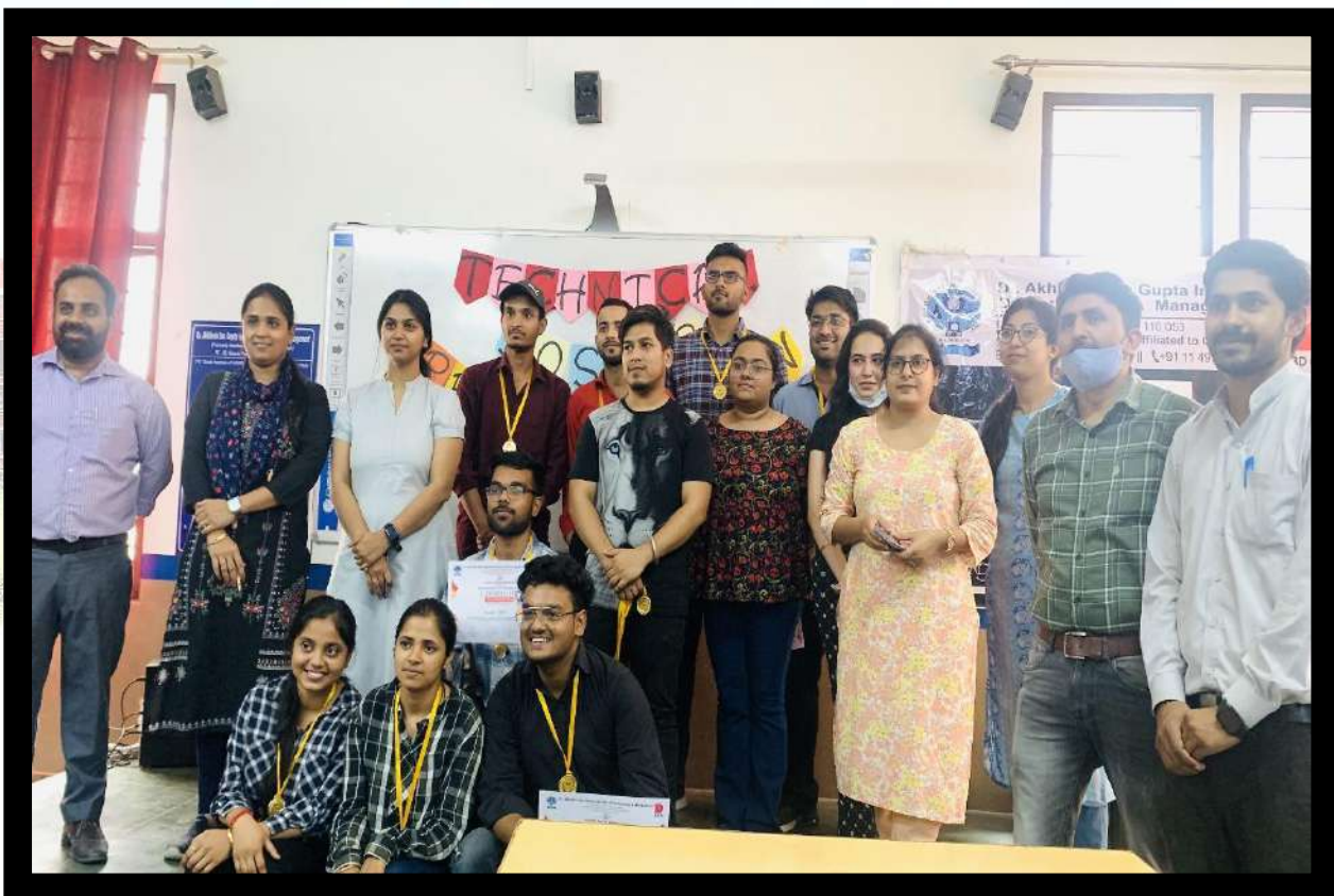
Winner and runner up students of, Department of Civil Engineering, ADGITM