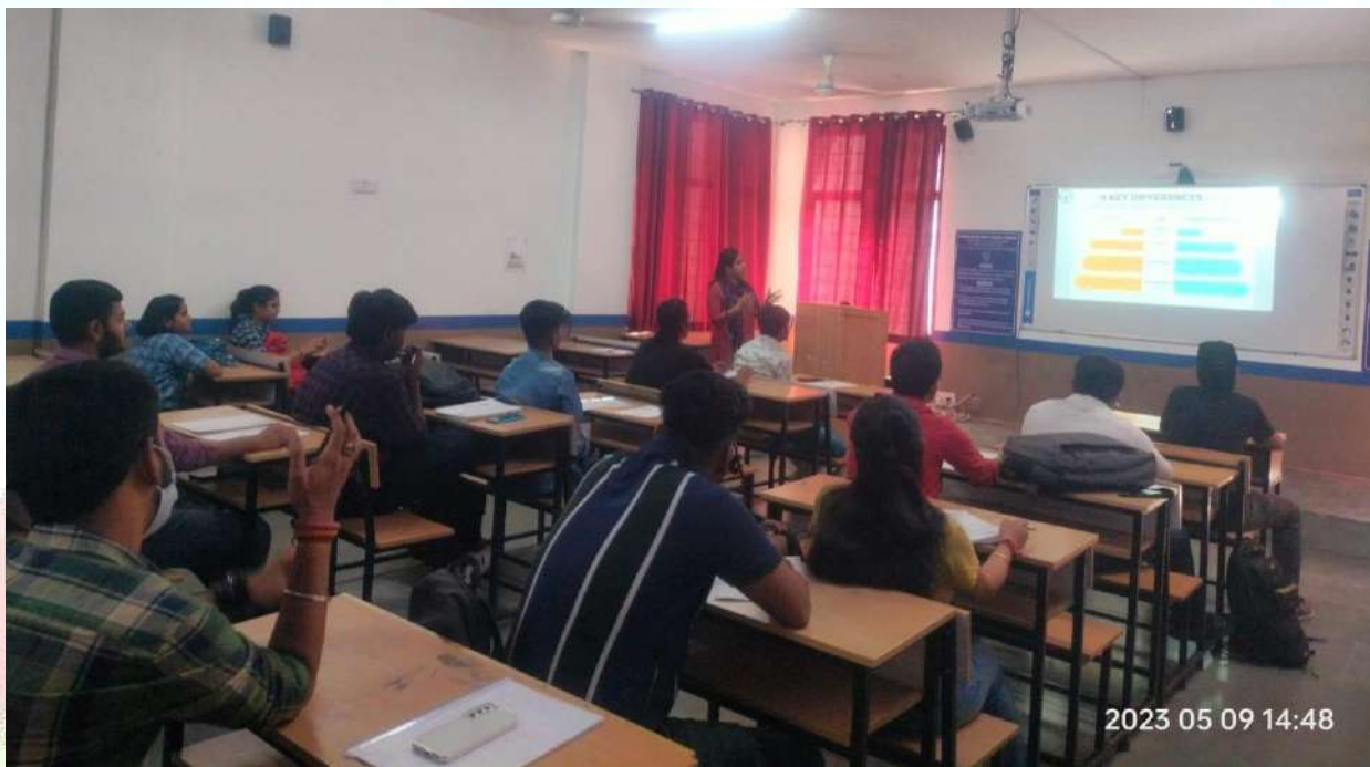
No of Participants in CV Writing workshop, Students of Civil Engineering Department