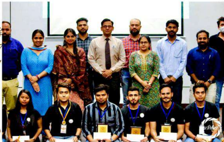
Neev members with esteemed Director and faculty