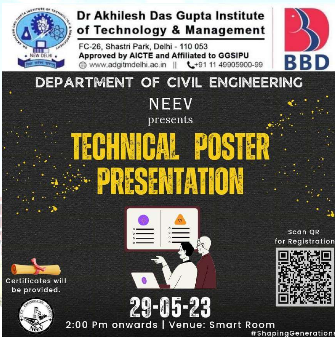
Poster of the Event

Department of Civil engineering (NEEV official society of civil engineering department) organized the Technical Poster Making Competition on 30 th May 2023, All the students actively participated in the event. Total 33 students participated in teams of three/four. All the students actively participated. All the winners were felicitated. Technical and aesthetic appearance of structures both are the pillar of civil engineering in this event students learned about the importance of aesthetics and architectural skills. Total No of Teams :11 Total No of Participants: 33 students.