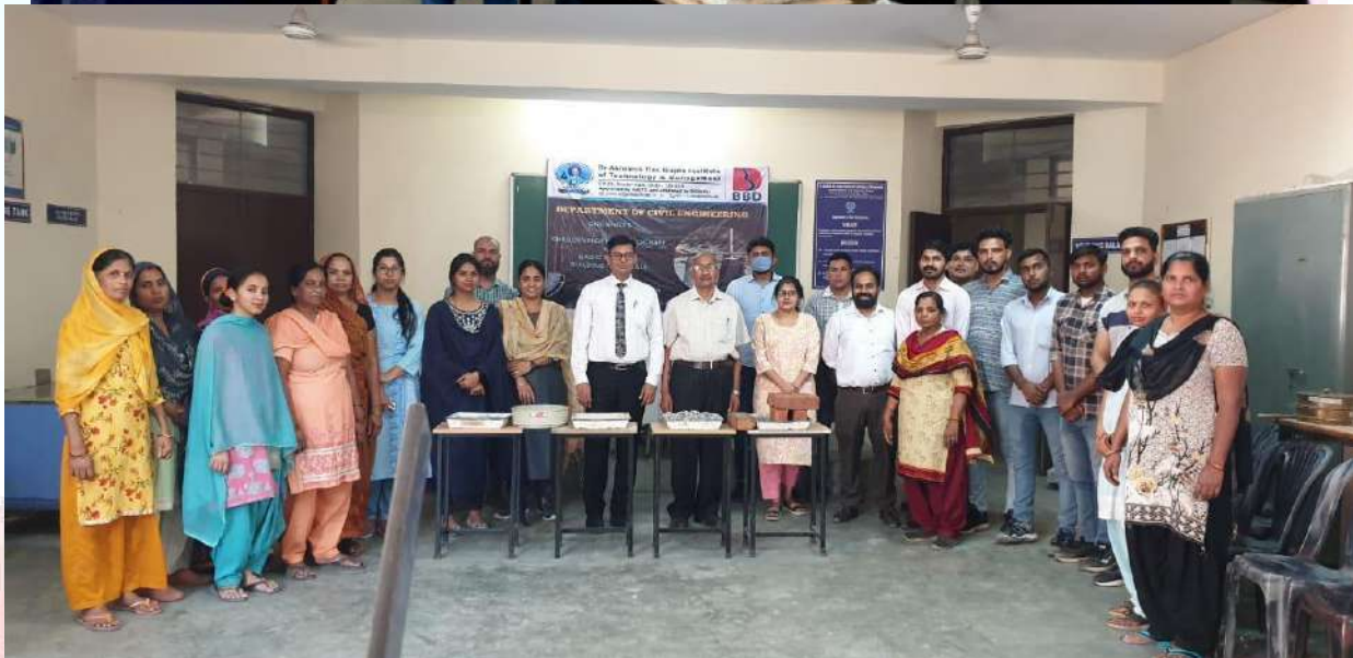
Faculty Members and staff of Department of Civil Engineering, ADGITM during the session