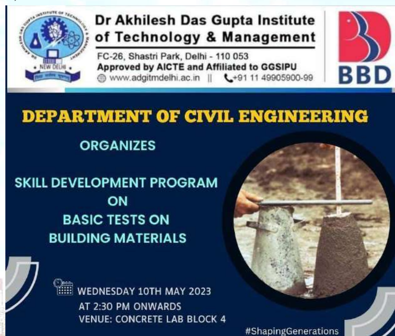
Poster of Skill Development Programme