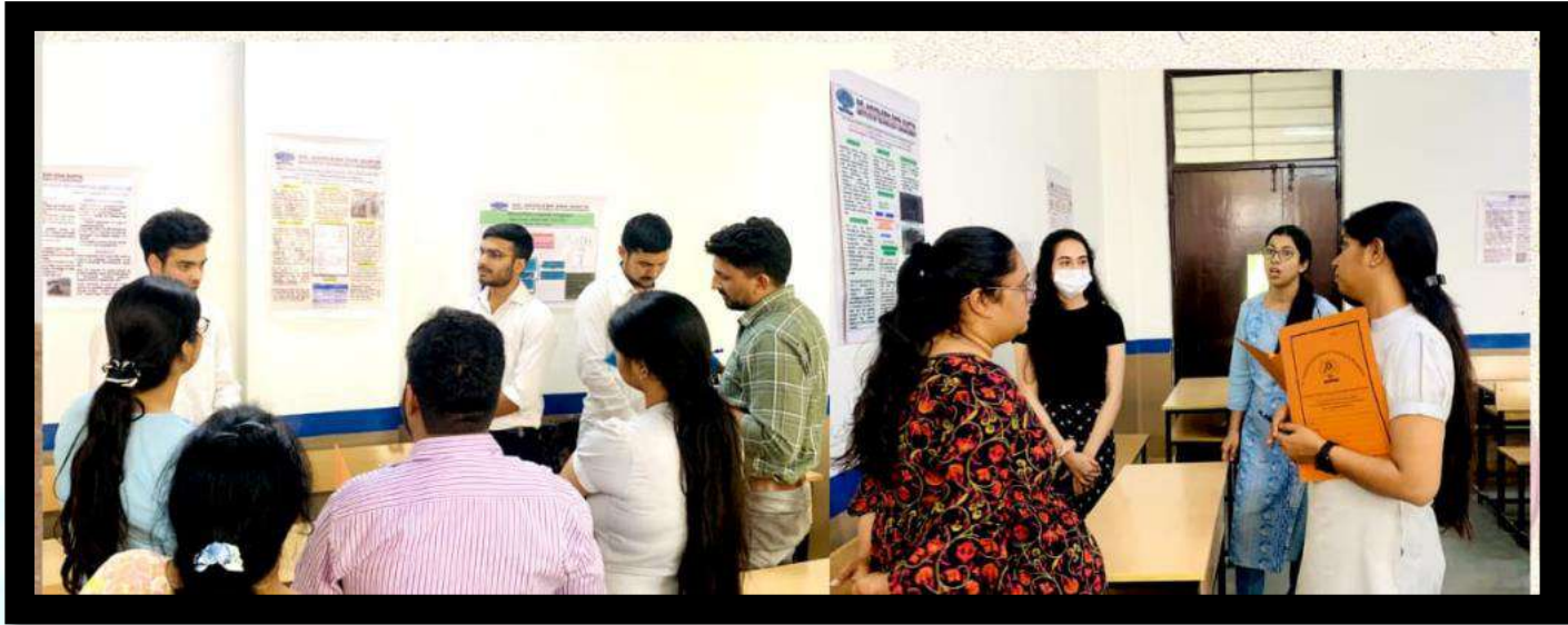
Participants Presenting their posters